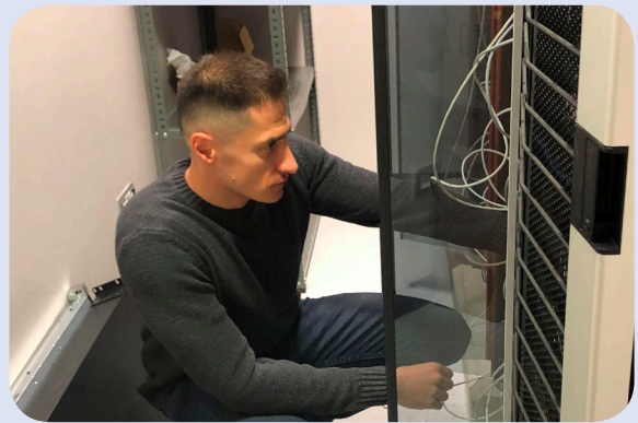
Georgia. National Center for Disease Control