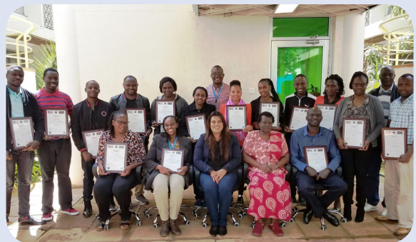
Kenya. Kenya Medical Research Institute