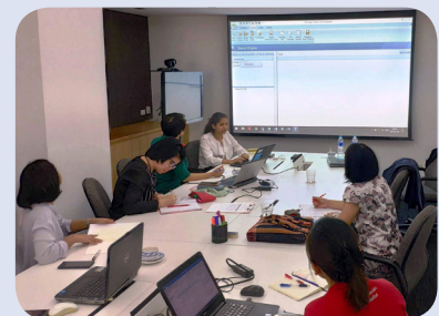
Thailand. Mahidol-Oxford Tropical Medicine Research Unit