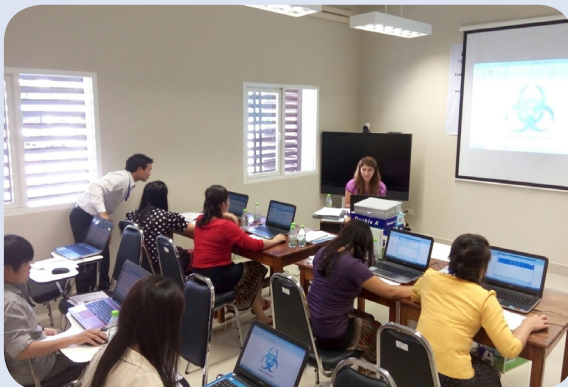
Laos. Institute Pasteur du Laos