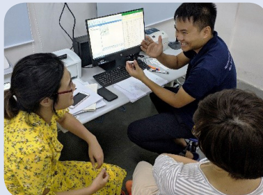
Vietnam. Institute of Microbiology and Biotechnology